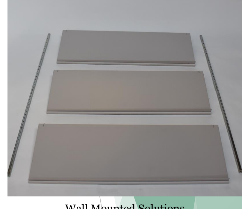
Wall Mounted Solutions